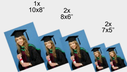
Graduate Wall Pack 1x 10x8", 2x 8x6" & 2x 7x5" prints

5 prints of the same image £175 5 prints - choose from 2 different images £225