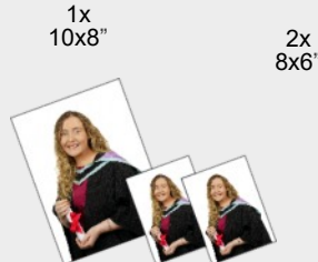
Graduate Introductory Pack 1x 10x8", 2x 8x6" prints