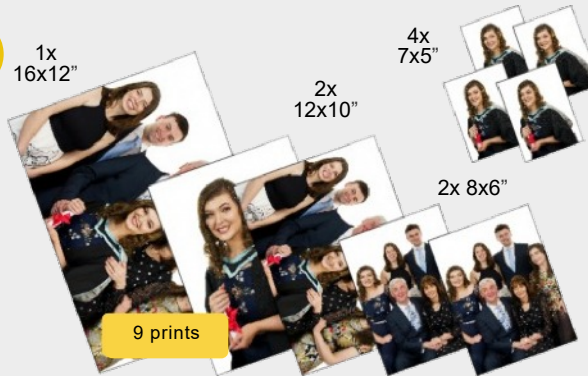
Ultimate Family Combo

Choose from 3 different images £355 Choose from 4 different images £395 Choose from 5 different images £415