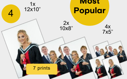
Family Combo Pack

Choose from 2 different images £265 Choose from 3 different images £295 Choose from 4 different images £325